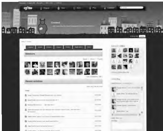
Connect home page - members view

In September, we hope to make ignite membership available to secondary-aged teenagers and adult leaders of SU Groups. This will involve a simple application form for those teenagers wishing to join, the details are yet to be confirmed but we'll explain how this will work nearer the time. In the mean time why not check out the new site at www.suignite.org.uk .